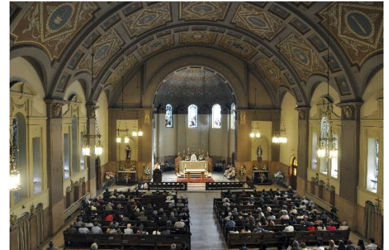
St. Vincent de Paul Church, Toronto