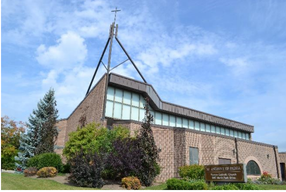
St. Anthony of Padua Church, Brampton

Sts. Peter and Paul , Mississauga: The parish exceeded its $850,000 goal and has now raised $872,000 .