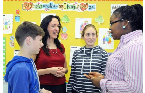
St. John the Evangelist Parish, Whitby: With the funds received from its Family of Faith campaign, the parish will invest in programs and activities to engage parishioners who wish to reconnect with the parish family.