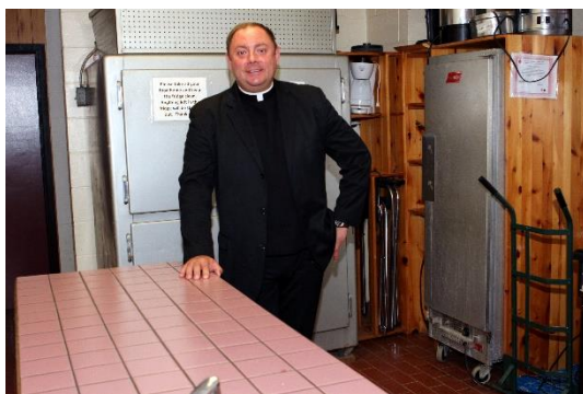
St. Mary Immaculate Parish in Richmond Hill will use part of its share to renovate the parish hall and kitchen and install an audio-visual system.

It's very important to understand the difference between the Archdiocese of Toronto's Pastoral Plan and the Family of Faith campaign plan. Every priority of the Family of Faith plan is found in the pastoral plan. However , not every pastoral plan initiative is funded through the Family of Faith campaign.