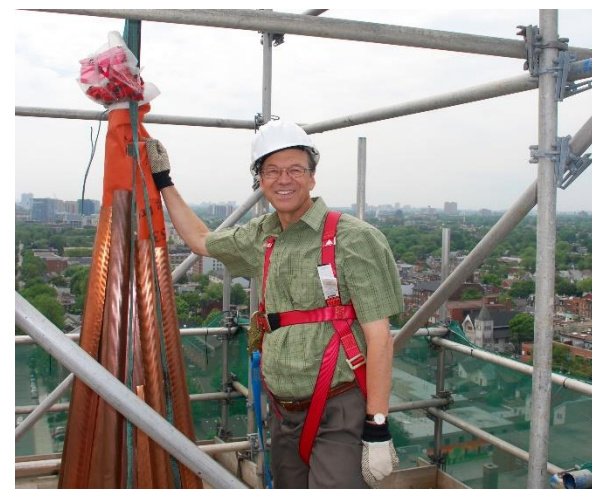
St. Mary's Parish, Toronto: For the past six years, the parish has been involved in the restoration of its church, rectory and parish halls. It is a big project, and will soon pass the $10 million mark.

With the funds that the parish receives from the Family of Faith campaign, it will pay down its debt to the archdiocese, owed for our church's restoration work.