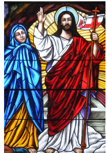
Stained Glass at St. Mary's, Nobleton.