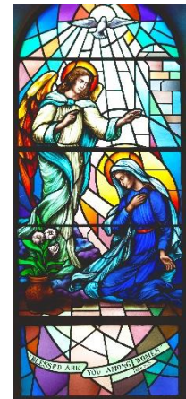
Stained Glass, Immaculate Heart Of Mary Church, Scarborough

Parish-by-parish results for parishes in previous waves can still be found on our webpage at ourFamilyofFaith.ca