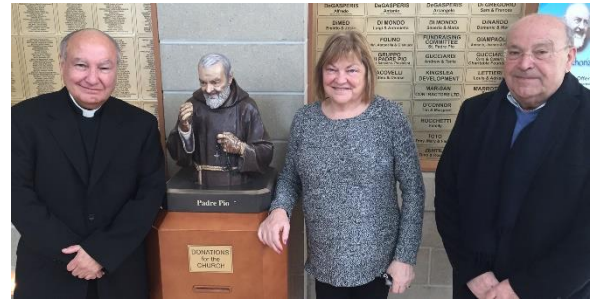
St. Padre Pio Parish in Kleinburg recently exceeded its parish goal.