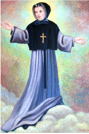
St. Marguerite D'Youville Parish in Brampton recently held a very successful Commitment Weekend.