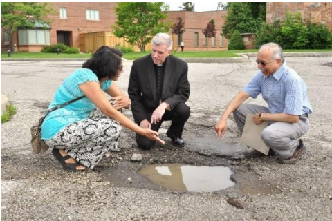
Some of the proceeds at St. Edward the Confessor Parish in North York will be used for much needed repairs to the church parking lot.