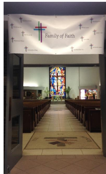
A Family of Faith banner greets all parishioners at St. Jane Frances Parish in North York.