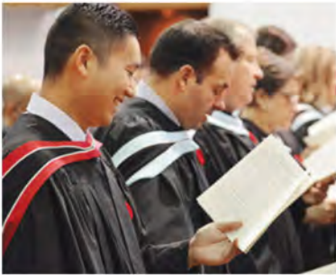
INSTITUTE OF THEOLOGY