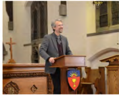
ECCLESIASTICAL FACULTY OF THEOLOGY

St. Augustine's Seminary offers a wide variety of programs for the catholic community.