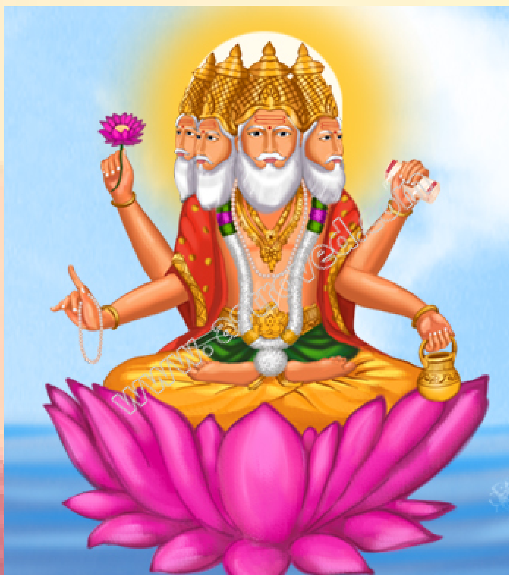
Brahma, who creates the universe