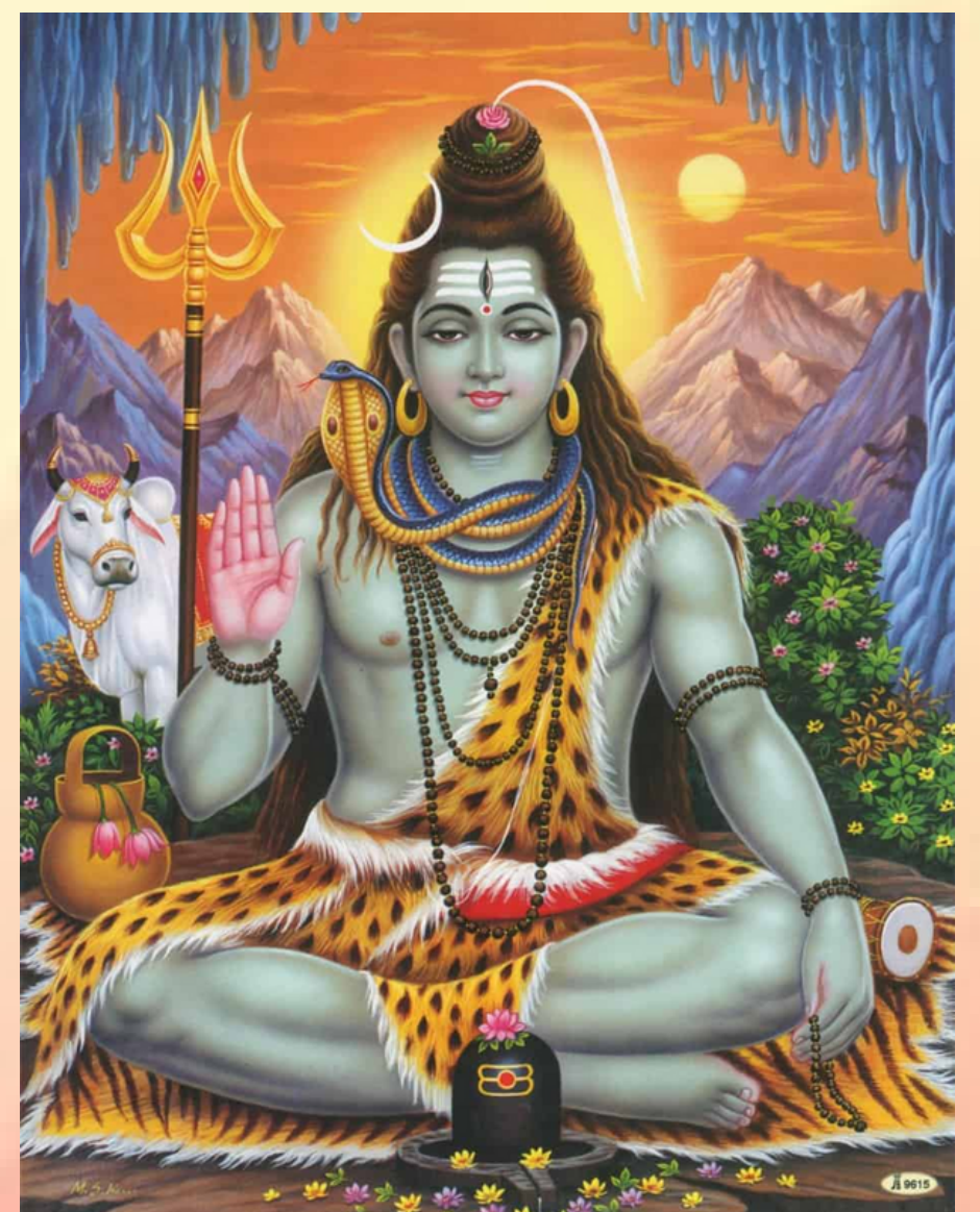
Shiva, who destroys the universe

A Hindu's goal in life is to reunite the Atman with the Brahman. In Hinduism, there are four paths to salvation. The path a Hindu follows generally depends on his or her nature and inclinations. Bhakti yoga, is the path of devotion. It is one of the simpler paths to salvation and involves devotion and love toward a personal deity. Karma yoga is the path of action, the key to this path is good deeds and thoughts, which will lead to the accumulation of good karma. Jnana yoga is the path of wisdom, this difficult path calls for the guidance of a guru, or teacher. Followers learn about the relationship between Brahman and Atman and about the nature of the universe. Raja yoga is the path of meditation, followers of this path achieve salvation through meditation, or deep contemplation, on Brahman.