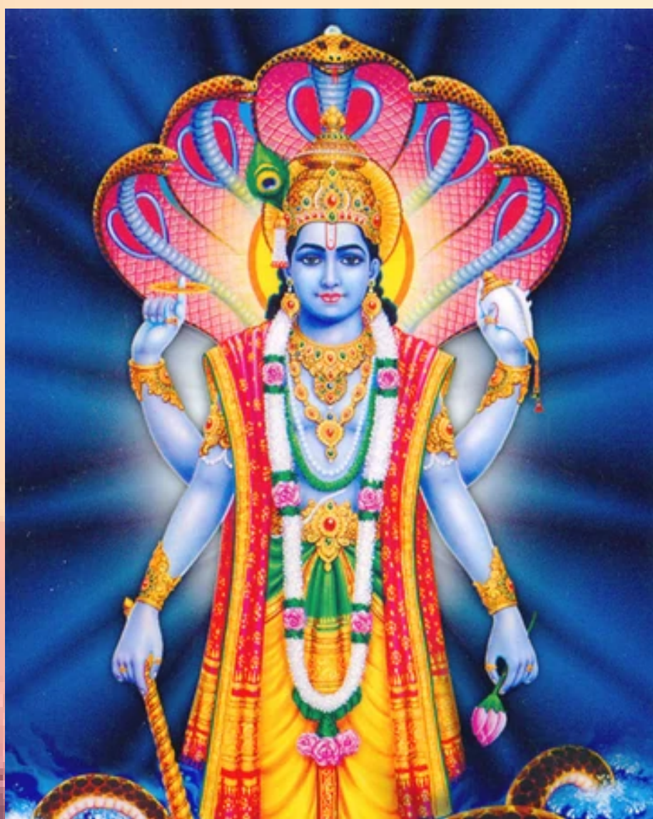
Vishnu, who preserves the universe

Brahma has four faces and is seated on a lotus. Saraswati is the goddess of learning and arts. Her vehicle is a peacock or a swan. Vishnu is the preserver of the universe, he has four arms in which he holds a conch shell, a discus, a lotus, and a mace. Lakshmi is the goddess of wealth, happiness and good fortune. She blesses her worshippers with wealth and liberation. Shiva is the destroyer and restorer of the universe and is associated with creative energy. His wife is Parvati. Parvati is the mother goddess whom Hindus worship as shakti or female energy. Atman is the human soul or spirit. It is part of our innermost self that is identical to Brahman, the universal soul.