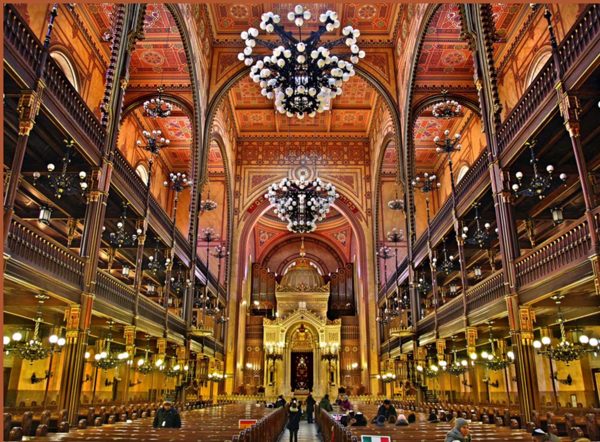
Inside Dohány Street Synagogue in Budapest, Hungary

Jewish beliefs centre on the idea of the oneness of God and the compassion God shared with creation in the form of the covenant. God governs the universe with justice and honour. Nothing happens without God, therefore humanity has an obligation to worship God. A Jew is a person who is either born Jewish or converts to Judaism. In the case of birthright, Jewish heritage generally follows the matrilineal descent of the child. In other words, if a child's mother is Jewish, then the child is Jewish. Judaism teaches that the covenant is a fact of life for all creation. It speaks to the reality that people are all connected and that, if they want fulfillment in life, they must treat life as an ongoing covenant. The Jewish tradition is one that is rich in its worship and prayer practices. Worship is certainly not confined to the Synagogue; the home is an important venue for worship as well. The Synagogue is the communal place of worship for Jews and is considered a place of gathering, of prayer, and of study or learning. The Sefer Torah, or Torah scroll, is the text of the five books of Moses written on parchment. It is the most sacred object of Jewish life and is essential for worship. The Torah reading is the central part of certain worship services during the week.